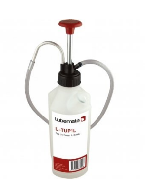
G077 Oil Transfer Pump