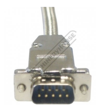
DSub9 Male Plug