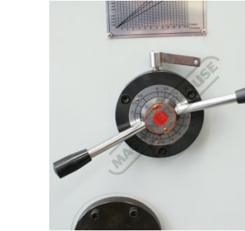
Rapid blade clearance adjustment