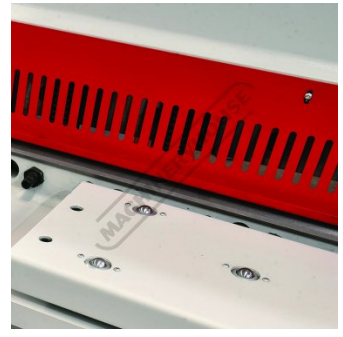
Ball transfer table