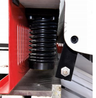
Hydraulic material hold downs