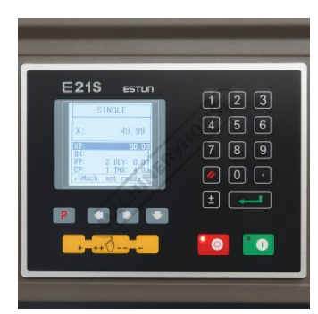
Estun E21S controller