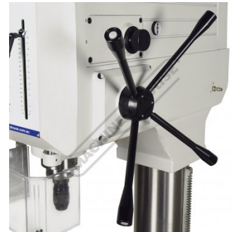
Quill Feed Handle