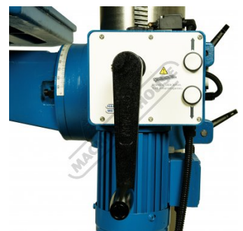
Manual Handle and Up Down Switches for Table Height