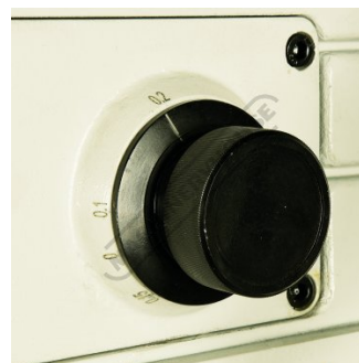
Automatic Feed Selection Dial