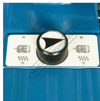
Manual Drive Or Motor Gear Drive Dial