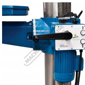
Motorised Rise-Fall Work Table