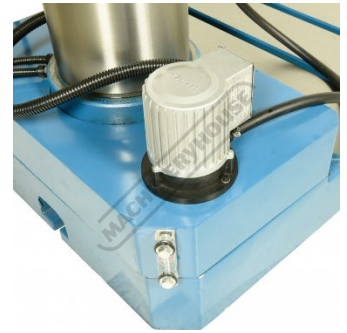
Coolant Pump System