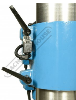
Table Clamps with Safety Micro