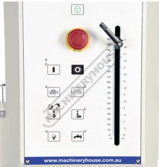
Depth Gauge And Control Panel