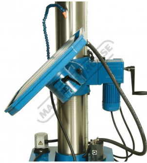
Table Tilts 90 Degrees Left or Right - shown at 45 degrees