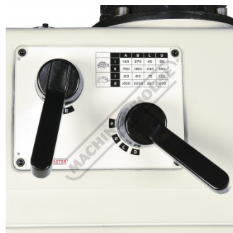
Spindle Speed Selection Levers