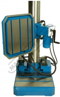
Swivel and Tilting Table