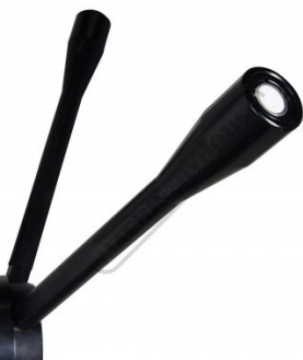
Electronic Feed Engagement