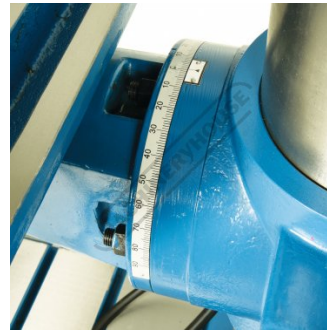
Table Tilt Adjustment Graduations