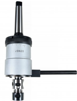
T005 Reversible Tapping Chuck - Adjustable Clutch