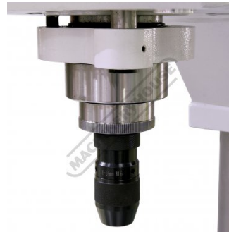
Drill Chuck And Arbor