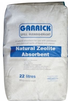
O000A Natural Zeolite Absorbent