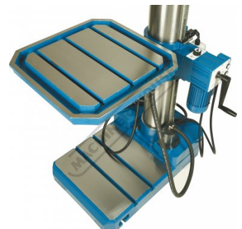
T Slotted Table and Base