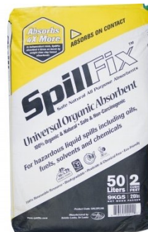
O000 SpillFix Universal Organic Absorbent