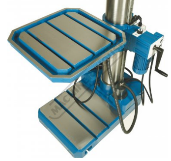
T Slotted Table and Base