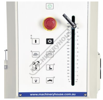
Depth Gauge And Control Panel