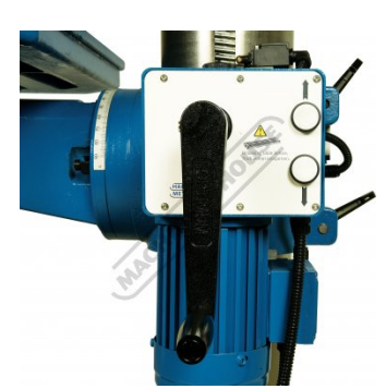
Manual Drive Or Motor Gear Drive Dial Manual Handle and Up Down Switches for Table Height