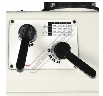
Spindle Speed Selection Levers