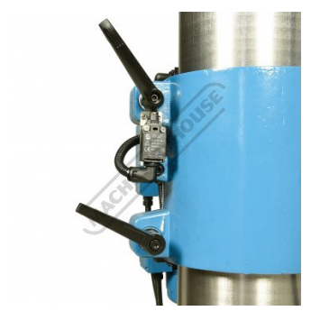
Table Clamps with Safety Micro