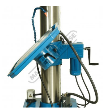
Table Tilts 90 Degrees Left or Right - shown at 45 degrees