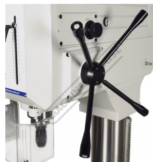
Quill Feed Handle