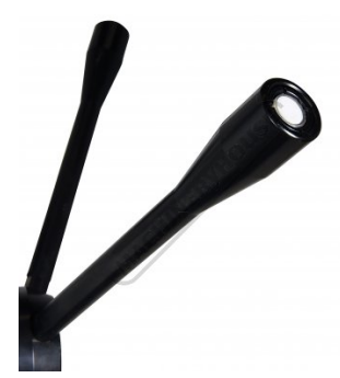
Electronic Feed Engagement