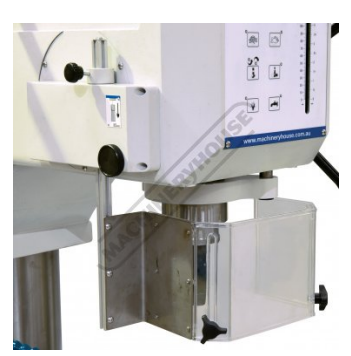
Safety Chuck Guard