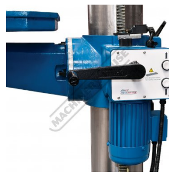
Motorised Rise-Fall Work Table