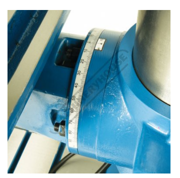
Table Tilt Adjustment Graduations Coolant Pump System