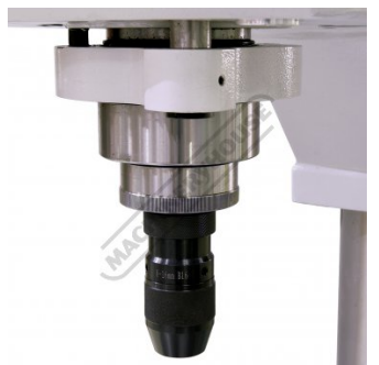
Drill Chuck And Arbor