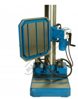
Swivel and Tilting Table

sales@machineryhouse.com.au www.machineryhouse.com.au