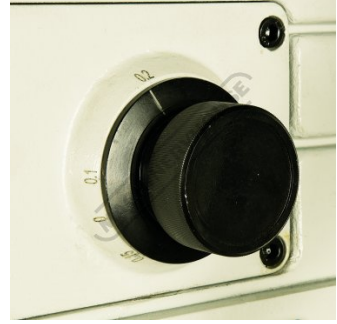
Automatic Feed Selection Dial