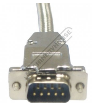
DSub9 Male Plug