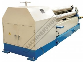
Left Rear View