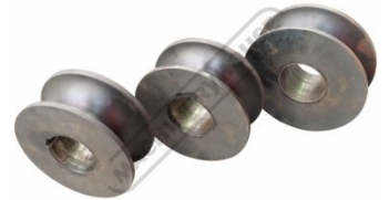
Includes 50mm Pipe Dies