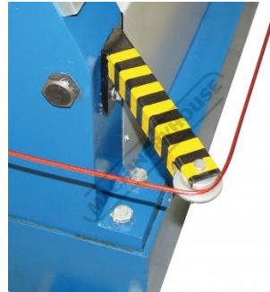
Safety Wire Interlock System