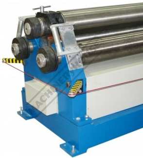
Section Roll End with Flat Bar Dies