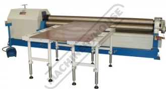
Shown with Optional Ball Transfer Tables