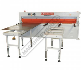
Rear guarding with safety sensors 1000mm Powered ballscrew back gauge