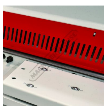
Ball transfer table