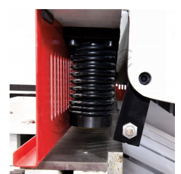
Hydraulic material hold downs