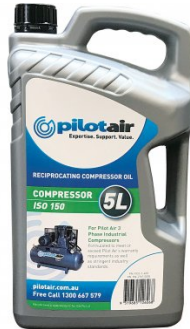
C346 ISO 150 Air Compressor Oil