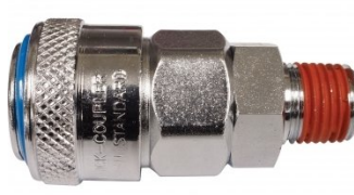
F941 High-Flow One Touch System Air Fittings