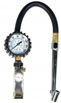
A259 Tyre Inflator with Dial Gauge