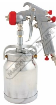
S325 Suction Spray Gun & Pot