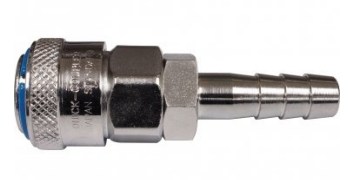
F945 High-Flow One Touch System Air Fittings