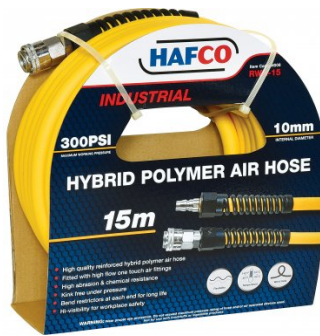
H008 Industrial Polymer Air Hose