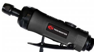
A040 Air Die Grinder