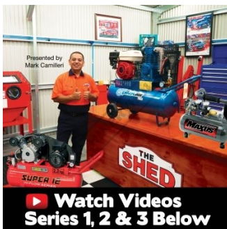
Intro, Selecting & Installing Compressors