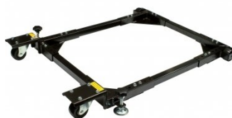
W931 Mobile Base - Heavy Duty