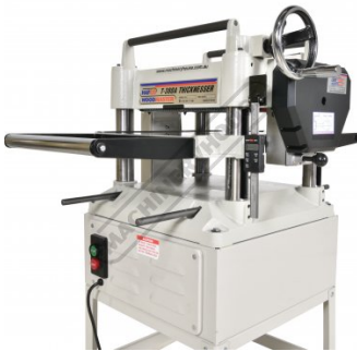
Robust 4 Post Design