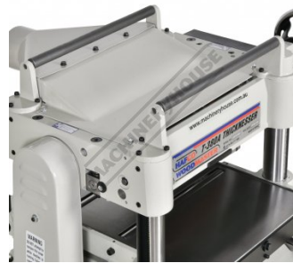
Feed Return Rollers