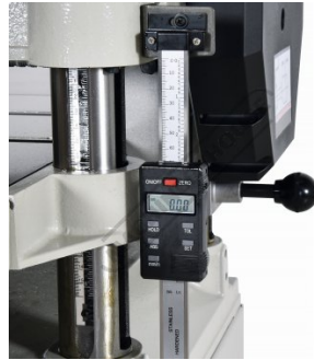
Digital Height Readout