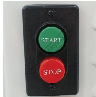
On Off Switch