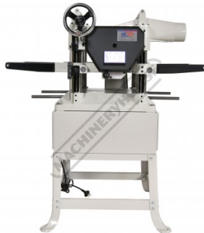
W414 Side View