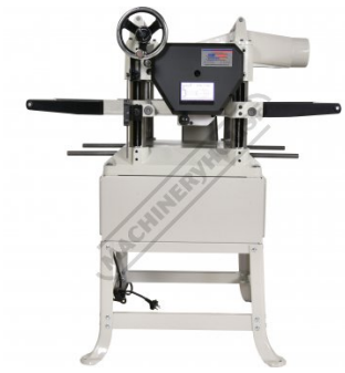
W414 Side View