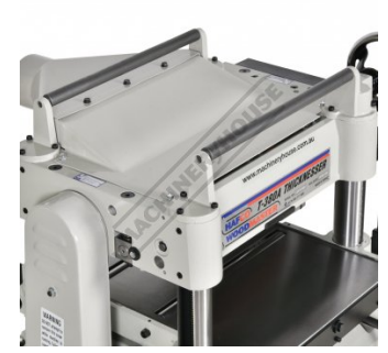
Feed Return Rollers