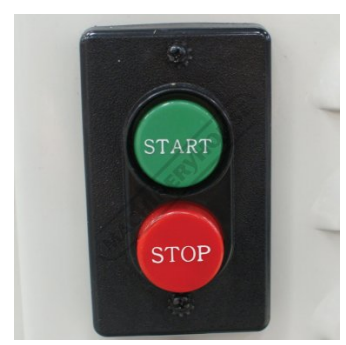
On Off Switch