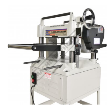
Robust 4 Post Design