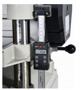
Digital Height Readout