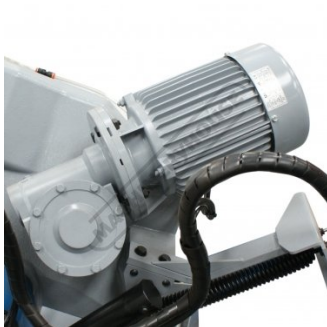
Motor and Gearbox Drive