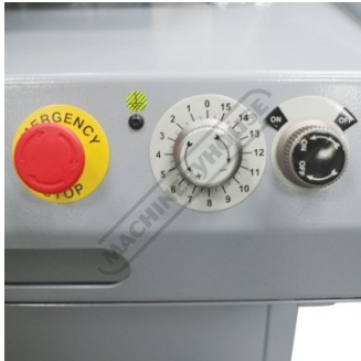
Adjustable Automatic Feed