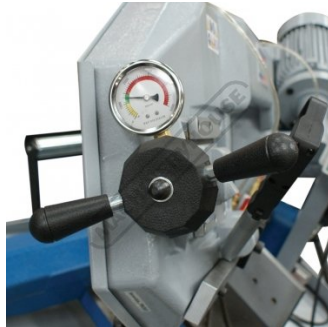
Blade Tension Gauge