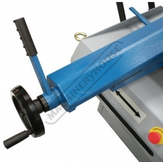
Quick Action Clamp Lever