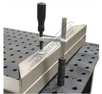
Shown Screwed into Optional Threaded Riser and Adaptor