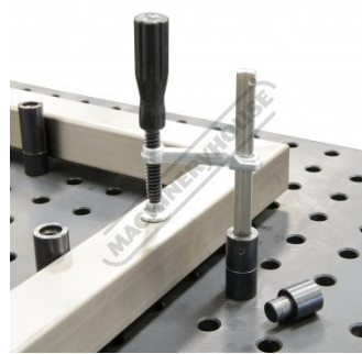
Shown Screwed into Optional Adaptor View2