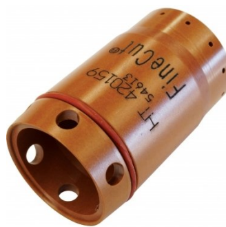
P858 Hypertherm FineCut Only Swirl Ring