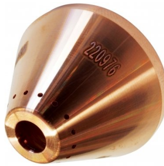
P854 Hypertherm 125A Shield