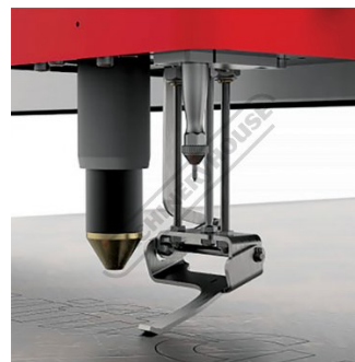
Initial Height Sense