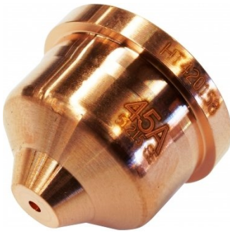
P852 Hypertherm 45A Nozzle