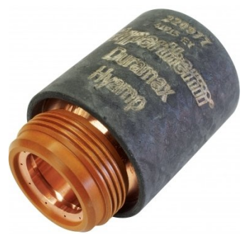
P859 Hypertherm 30-125A Retaining Ring Cap