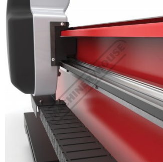
Linear Rail Rack-Side