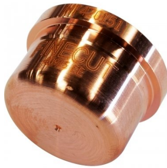
P853 Hypertherm FineCut Only Nozzle