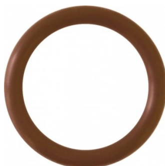
AP0006 Hypertherm O-Ring