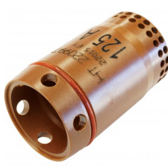
P857 Hypertherm 125A Swirl Ring