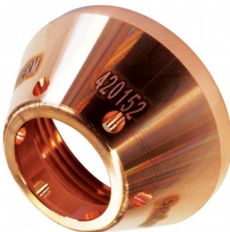
P856 Hypertherm FineCut Only Shield