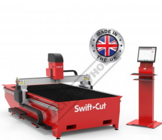
Pro 2.5m Made In UK