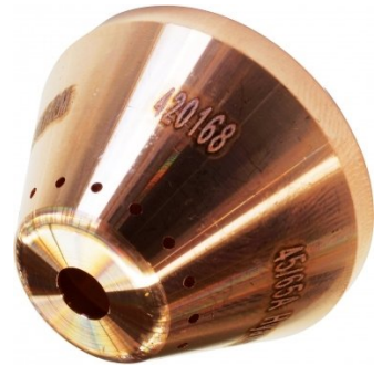
P855 Hypertherm 45-65A Shield