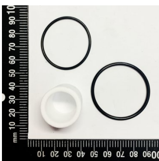
AP0001 Air filter element - Internal filter Powermax