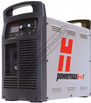
Supplied With Powermax125