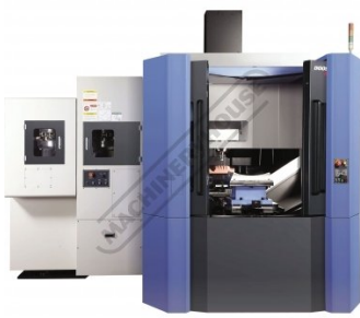
VC630 5AX APC front open