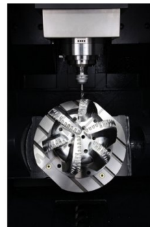
VC630 Workpiece 2