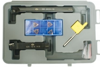
L458 Lathe Threading Tool Kit - Insert Type