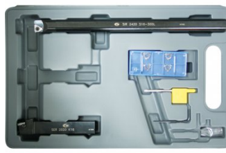
L459 Lathe Threading Tool Kit - Insert Type