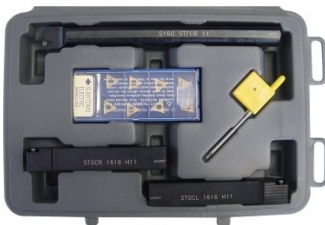
L452 Lathe Turning Tool Kit - 3 piece Insert Type