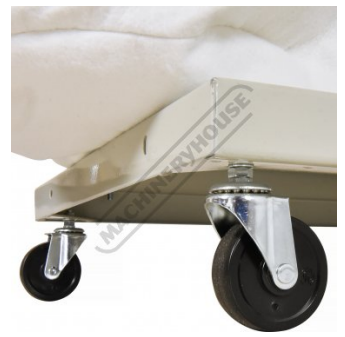
4 Swivel Wheels