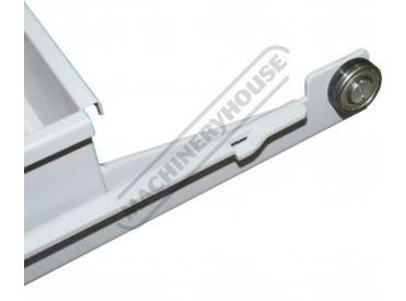
Drawer Ball Bearing Arms