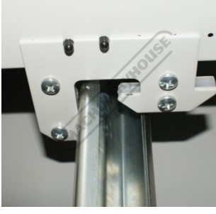
Drawer in Lock Position