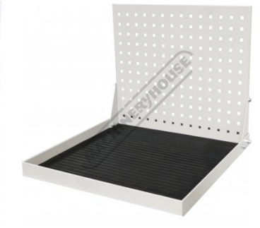
Backing Top Panel