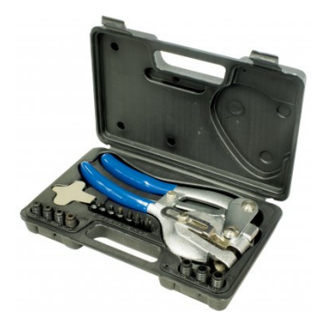
S200 Joggler & Punch Plier