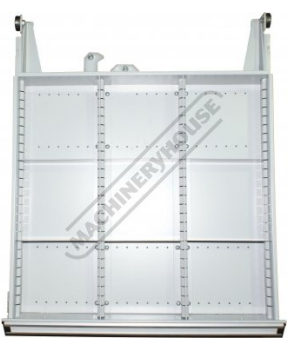
Heavy Duty Drawers