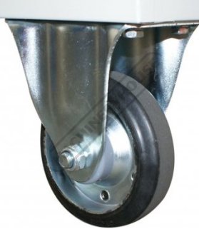
2 x Fixed Wheels