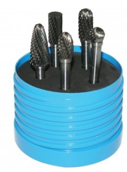
B905 Carbide Burr Double Cut Set -Long Series

B900 Carbide Burr Double Cut Set -Short Series