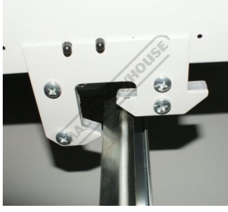
Drawer in Unlock Position