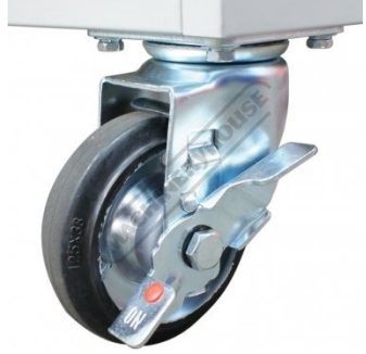
2 x Brake Swivel Wheels