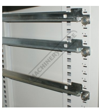
Heavy Duty Drawer Slides