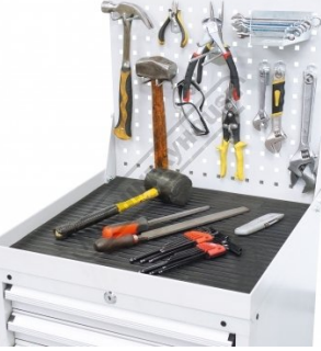
Shown with Optional Tools