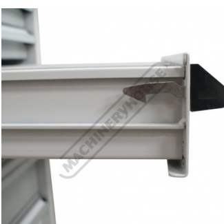
Drawers with Safety Lock