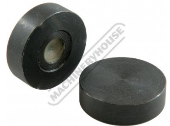
8 x Magnetic Rest