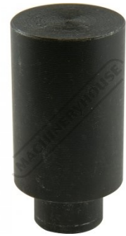
4 x Insert Stop