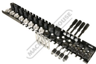
Shown on Optional Tool Tray (W08524)