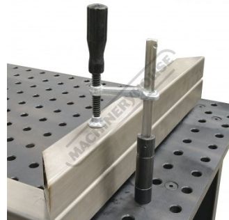
Shown Screwed into Threaded Riser with Optional Adaptor