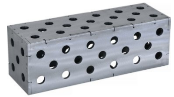
W08577 Welding Table Riser Block