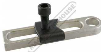
4 x Stop Bar Assembled