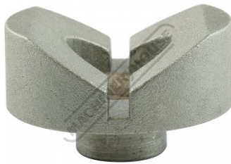
8 x V Block