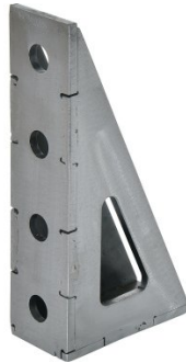
W08532 Welding Table Square