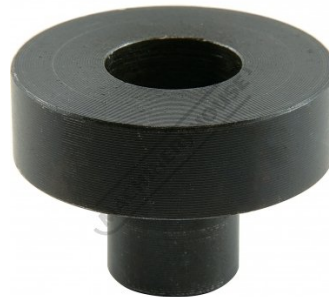
4 x V Spacer