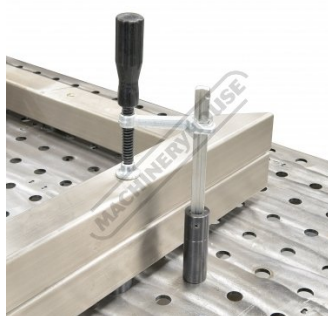
Shown Screwed into Threaded Riser