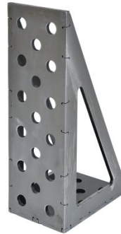
W08554 Welding Table Square