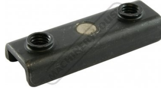
4 x Threaded Magnetic Adaptor