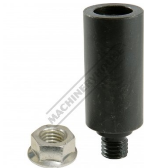
4 x Positioning Stop