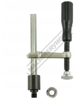
4 x Clamp