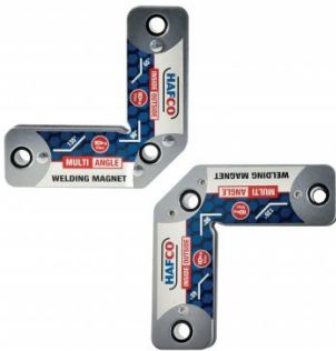
W1081 Multi Angle Corner Magnets