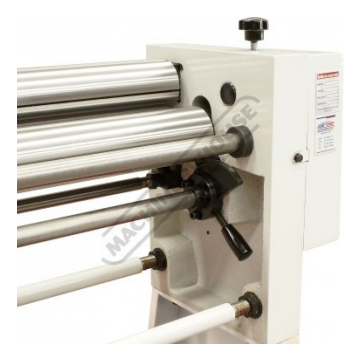
Rear Curving Roller Cam Handle