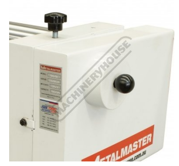
Low Speed 3.5 to 1 Gear Disengagement