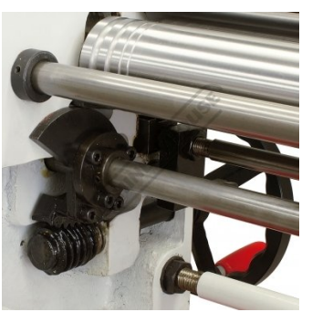
Rear Curving Roller Cam Mechanism Slit in Top Roller 10mm Deep