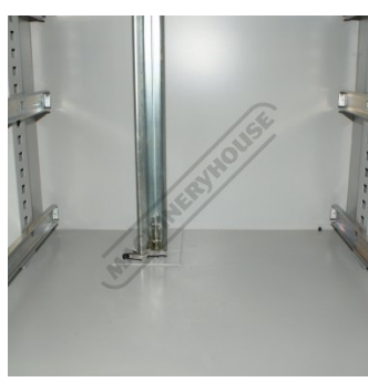
Drawer Locking Mechanism