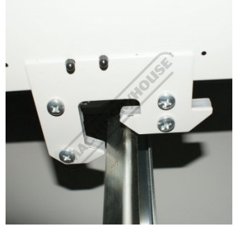
Drawer in Unlock Position