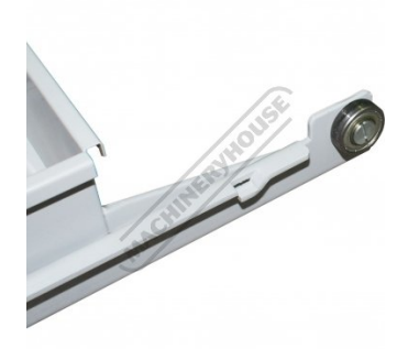
Drawer Ball Bearing Arms