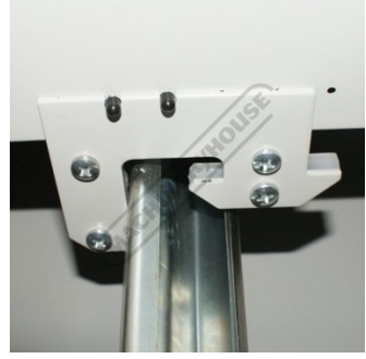
Drawer in Lock Position