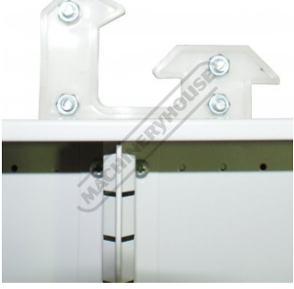
Drawer Lock Bracket