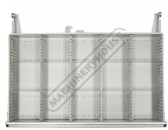
Heavy Duty Drawers