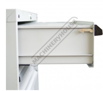
Drawers with Safety Lock