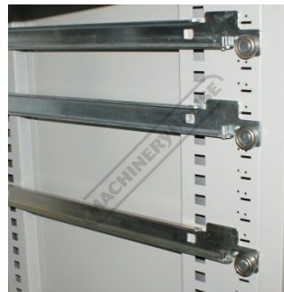
Heavy Duty Drawer Slides