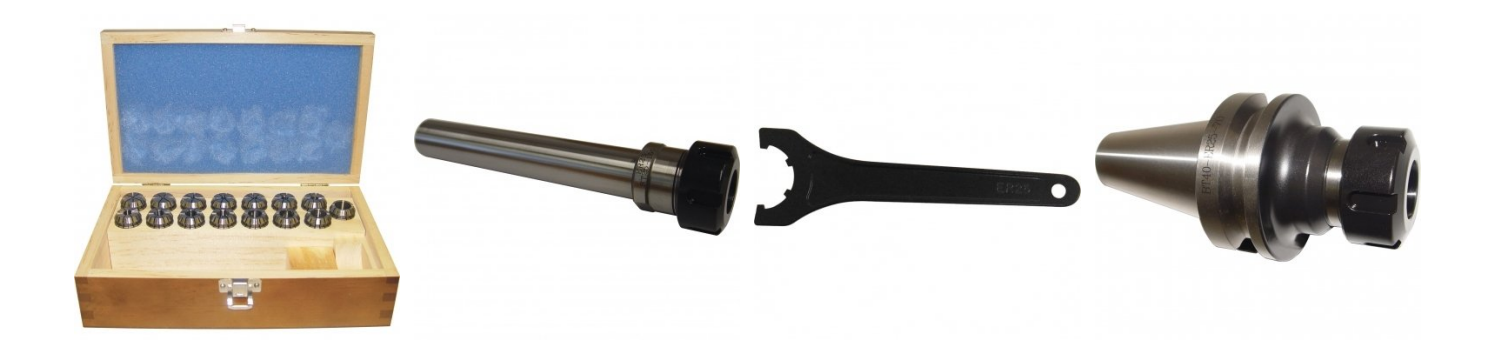
T214 BT40 x ER25-70 Collet Chuck