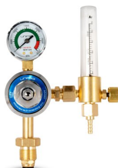
W161 Argon Gas Regulator-Bobbin Flowmeter