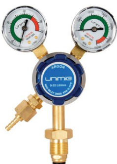
W160A Argon Gas Regulator-Twin Gauge