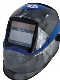
W001 Auto Darken Welding Helmet - 9-13 Shade