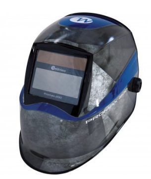
W002 Auto Darken Welding Helmet -9~13 Shade