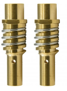
W537 2 x Contact Tip Holders