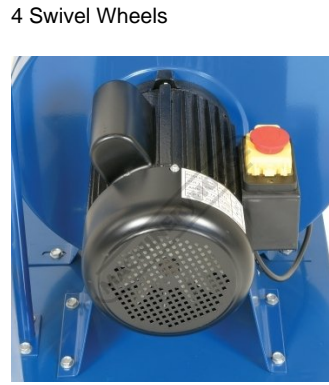
2hp 240V Motor