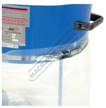
Bottom Bag Quick Action Clamp