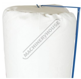
Top Bag Support Arm