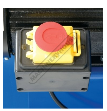
Emergency Stop Switch