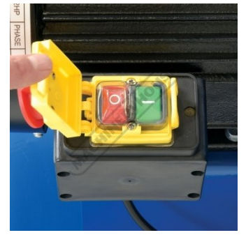
On Off Switch