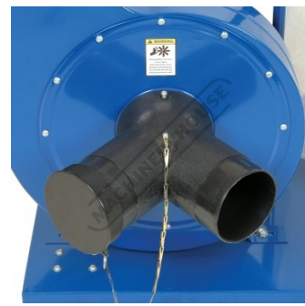
100mm Twin Inlets