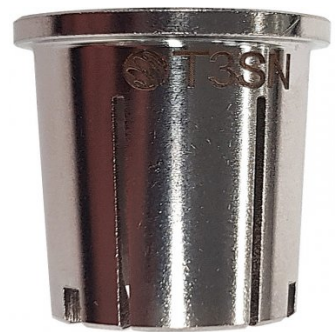
W6006 Heat Isolator