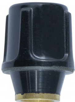
W6007 Short Back Cap