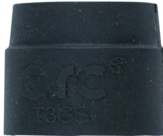
W6005 Head Gasket