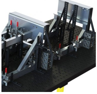
Shown with Optional Clamps Fixtures Setup Shown with Optional Clamps Fixtures Setup CloseUp