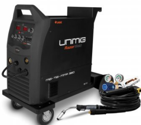
W183 MIG/TIG/STICK WELDER