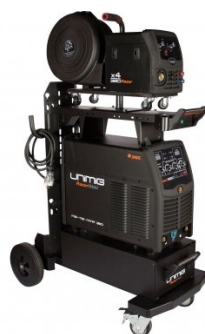
W187 MIG/TIG/STICK WELDER