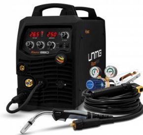
W179 MIG/TIG/STICK WELDER