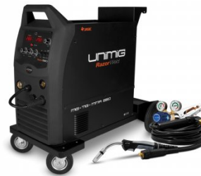
W182 MIG/TIG/STICK WELDER