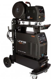
W186 MIG/TIG/STICK WELDER