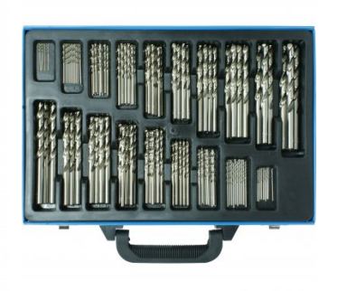
D1171 Metric Industrial HSS Reduced Shank Drill Set