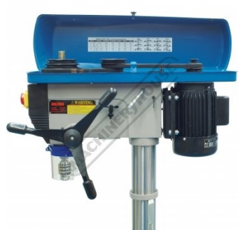
A Section Belt Drive System