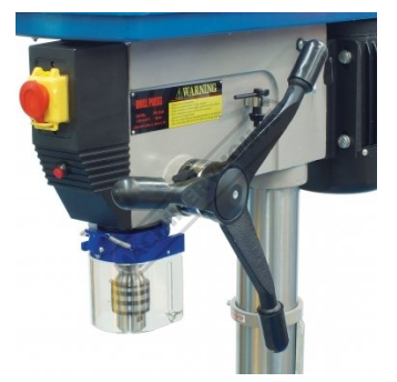
1 Piece Cast Iron Drilling Lever