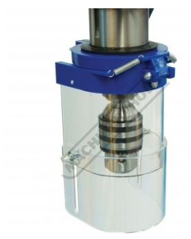
Adjustable Safety Chuck Guard with Flip Up Screen