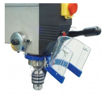
Safety Chuck Guard Flipped Up