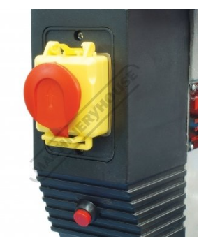
Emergency Stop Switch and Light Switch