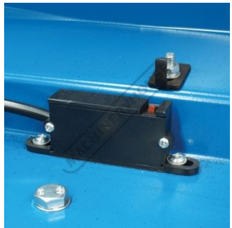
Safety Micro Switch on Pulley Guard Head Side View