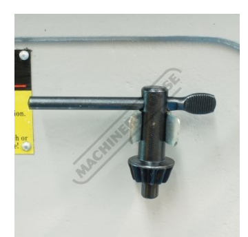
Chuck Key Holder