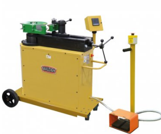
B8090 Motorised Pipe & Tube Rotary Draw Bender