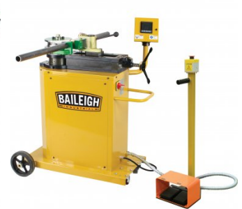
B8085 Motorised Pipe & Tube Rotary Draw Bender