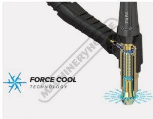
Force Cool Technology