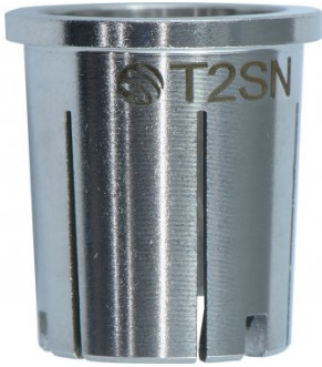
W5997 Heat Isolator