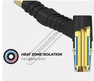
Heat Zone Isolation Technology