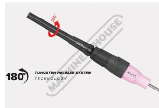
Tungsten Release System