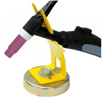
W10361 Magnetic TIG Torch Rest