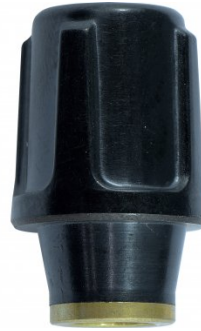
W5999 Short Back Cap