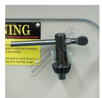
Chuck Key Holder