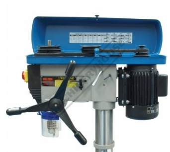
A Section Belt Drive System