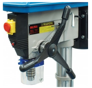
1 Piece Cast Iron Drilling Lever