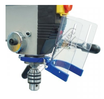
Safety Chuck Guard Flipped Up