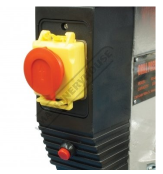
Emergency Stop Switch and Light Switch Work Light