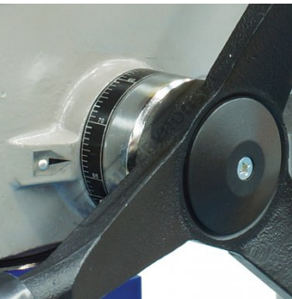
Drilling Depth Stop Setting With Scale