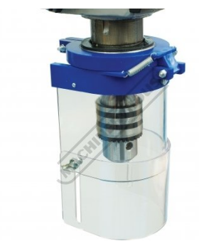
Adjustable Safety Chuck Guard with Flip Up Screen