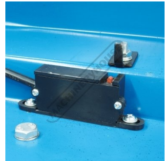
Safety Micro Switch on Pulley Guard Head Side View