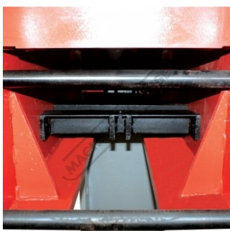
Table Height Lifting Points