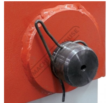
Pin Safety Clip