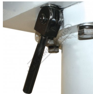
Head Locking Handle