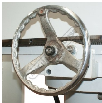
Head Movement Handle