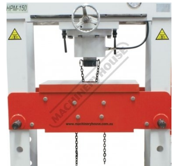
Table Height Adjustment Using Chain