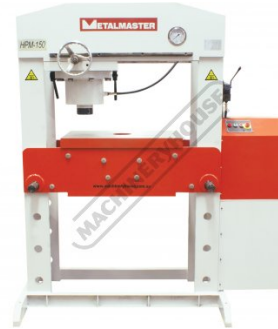
Front View Head Left Position