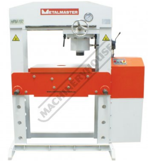
Front View Head Right Position