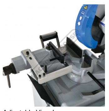
Adjustable Vice Jaws