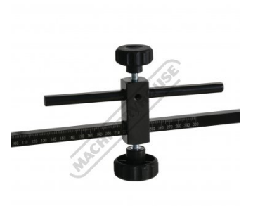
Adjustable Cut Length Stop