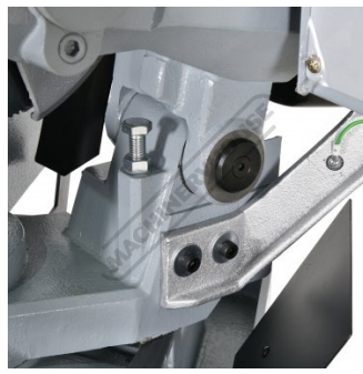
Heavy Duty head Pivot Hinge