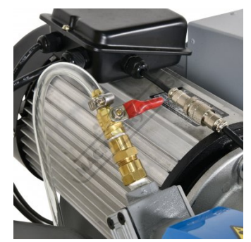
Collant Flow Control Valve