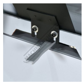
Swivel Head Lock Lever