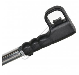
Deadman Trigger Switch