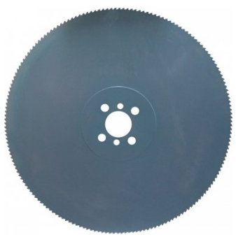
S158X HSS + COBALT Cold Saw Blade