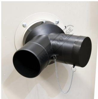
100mm Dual Inlets