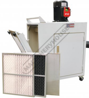
3 Stage Filter System - 1 Micron