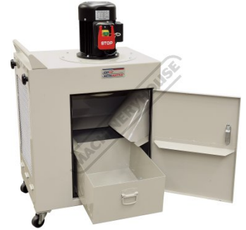
Removable Dust Collection Bin