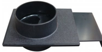
W336 Dust Hose Elbow