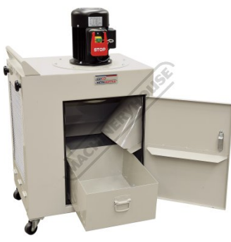
Removable Dust Collection Bin