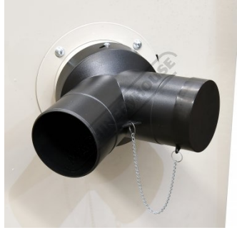
100mm Dual Inlets