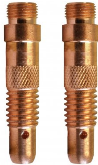
W586 2 x 1.6mm Collet Holders