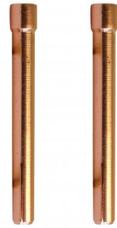
W593 2 x 2.4mm Collets