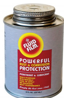
O043 Rust & Corrosion Preventive - Penetrant & Lubricant