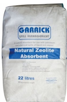
O000A Natural Zeolite Absorbent