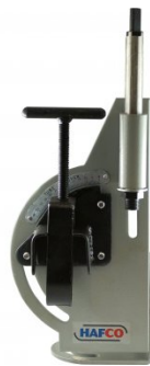
P090 Pipe & Tube Notcher Attachment