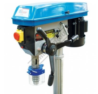
80mm Spindle Travel