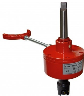
T002 Reversible Tapping Chuck