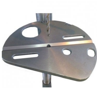
D199 VAZEY Drill Press Table