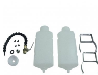
P220 Gravity Feed Coolant System