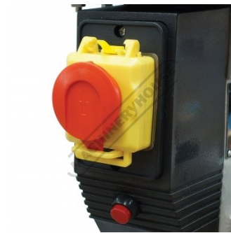
Emergency Stop Emergency Switch and Light Switch