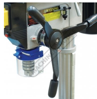
1 Piece Cast Iron Drilling Lever

Emergency Stop Emergency Switch and Light Switch Work Light