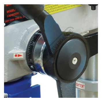
Drilling Depth Stop Setting With Scale