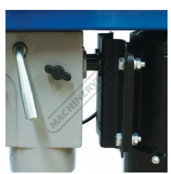
Belt Tension Lever and Lock