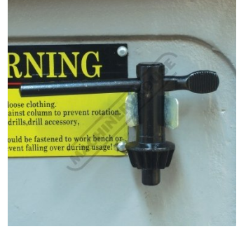
Chuck Key Holder

sales@machineryhouse.com.au www.machineryhouse.com.au