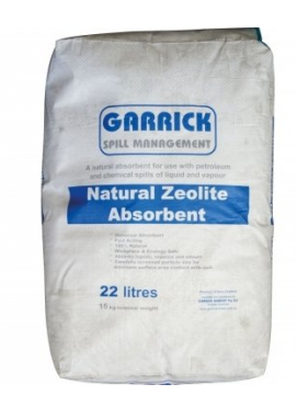
O000A Natural Zeolite Absorbent