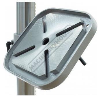
Tilting and Rotating Cast Iron Table Work Table