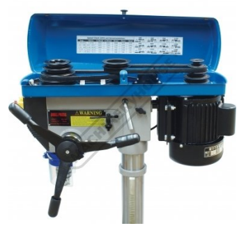
A Section Belt Drive System