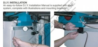
DIY INSTALLATION An easy-to-follow DIY Installation Manual is supplied with each system, complete with illustrations and mounting brackets.