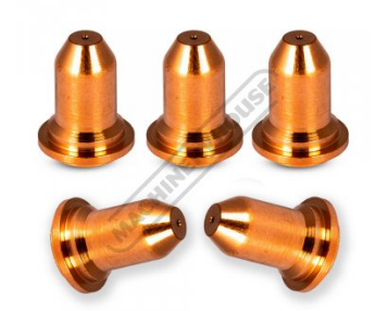
Cutting Tip Pack Of 5