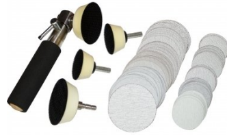
W305 Bowl Sanding Tool