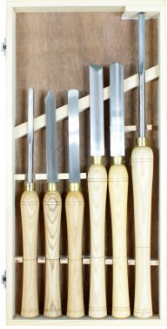
W302 HSS Wood Turning Tools - 6 Piece Set