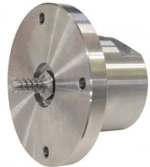
W297 Face Plate