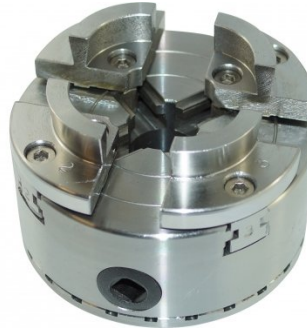
W370 Scroll Chuck - 100mm