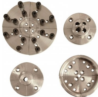
W375 Scroll Chuck Accessory Kit