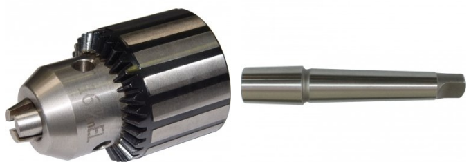
D442A 2MT x JT3 Drill Chuck Arbor