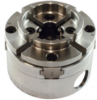
R8198 Scroll Chuck - 90mm - with Bonus 50mm Face Plate Ring