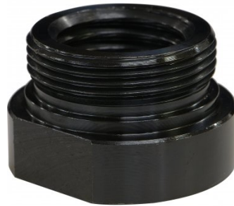
W366 Scroll Chuck Insert - M30 x 3.5mm