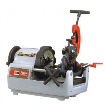
T024A Pipe Threading Machine -Automatic Die Head