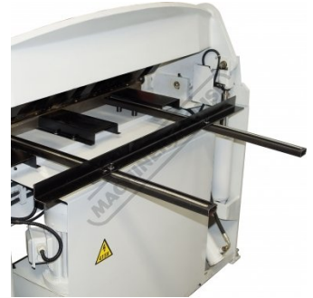
Rear Back Gauge