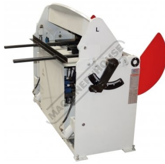
Rear Side View