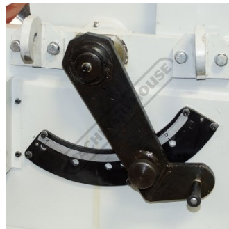
Rapid Blade Adjustment for Material Thickness