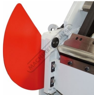
Apron Safety Guard