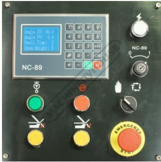
NC 89 Control Panel