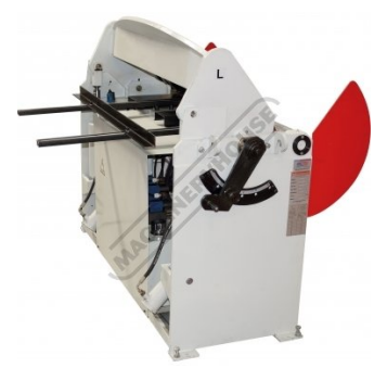
Rear Side View