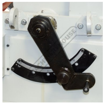
Rapid Blade Adjustment for Material Thickness Apron Safety Guard