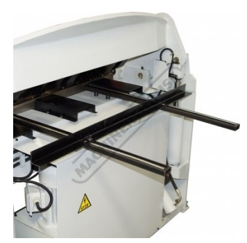
Rear Back Gauge