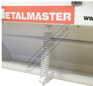
Spring Return Clamp Beam & Foot Pedal