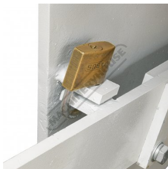
Isolation Tabs Shown Locked with Optional Padlock