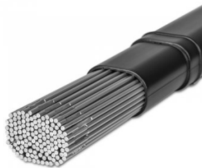
W127 Ø1.6mm TIG Filler Rod - Stainless Steel