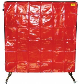
W225 Welding Curtain