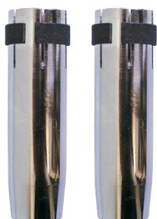
W564 2 x Conical Nozzles