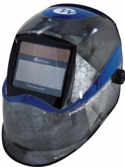
W001 Auto Darken Welding Helmet - 9-13 Shade