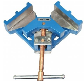
V099 90 degree Angle Vice Clamp