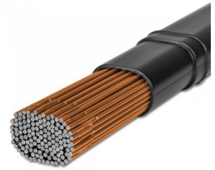
W125 Ø1.6mm TIG Filler Rod - Mild Steel