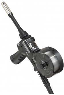
W181C Spool Gun - Light Duty