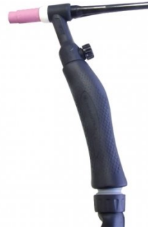
W171D Air Cooled TIG Welding Torch