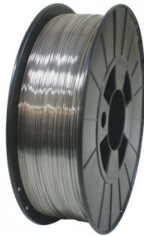
W145 Ø0.9mm Gasless Mild Steel MIG Welding Wire