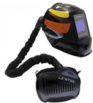
W159 Auto Darken Welding Helmet with PAPR Respiratory System - 5-9, 9-13 Shade