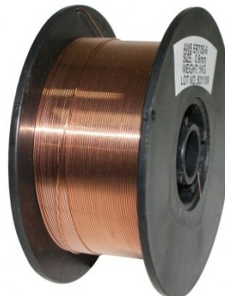
W138 Ø0.6mm Mild Steel MIG Welding Wire