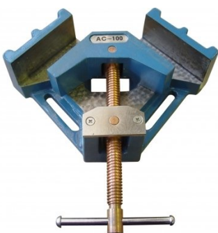
V100 90 degree Angle Vice Clamp