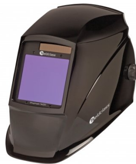
W003 Auto Darken Welding Helmet - 5-8 / 9-13 Shade