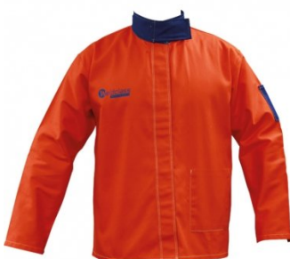
W1000A Promax HV5 Welding Jacket