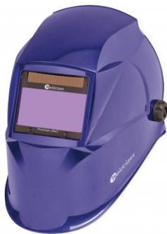
W002 Auto Darken Welding Helmet - 9-13 Shade