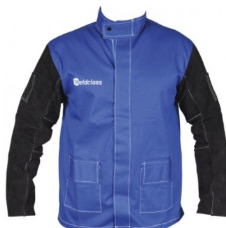
W1001A Promax Blue FR Welding Jacket