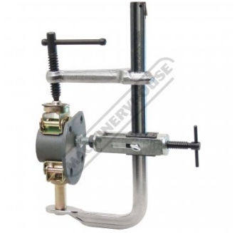
Shown Mounted to Clamp