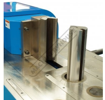
Hydraulic Horizontal Press