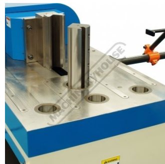
Table with Posts Removed for Optional Attachments