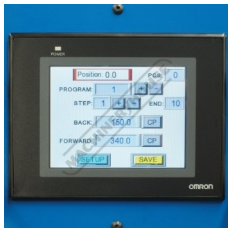
Touch Screen NC Control