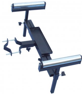
W3425 Drill Press Roller Support