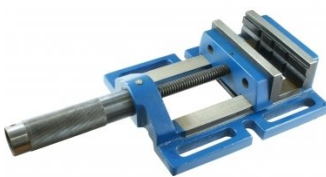
V145 Drill Press Vice