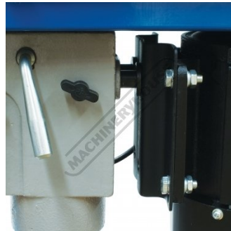
Belt Tension Lever and Lock