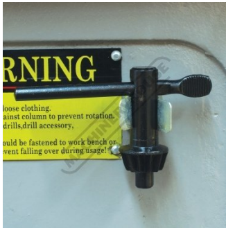
Chuck Key Holder