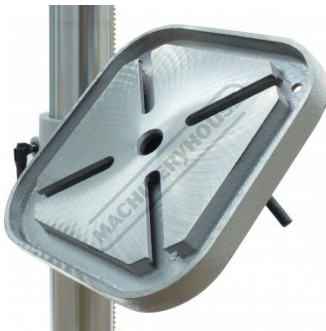
Tilting and Rotating Cast Iron Table