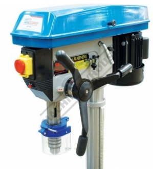
80mm Spindle Travel