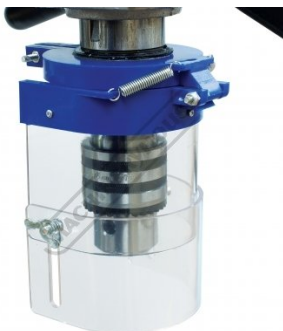
Adjustable Safety Chuck Guard with Flip Up Screen