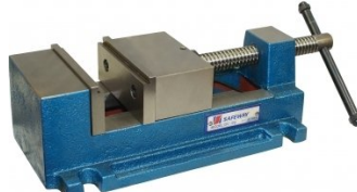
V141 Safeway Precision Drill Press Vice