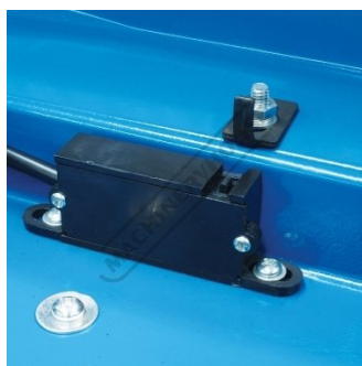
Safety Micro Switch on Pulley Guard