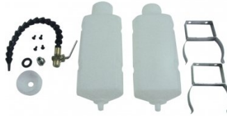
P220 Gravity Feed Coolant System