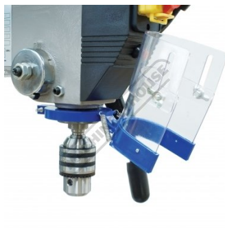
Safety Chuck Guard Flipped Up