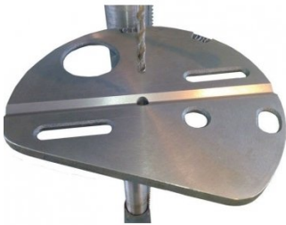
D199 VAZEY Drill Press Table