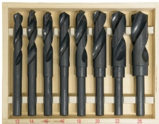
D117 Metric HSS Reduced Shank Drill Set