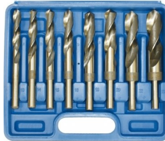
D1171 Metric Industrial HSS Reduced Shank Drill Set