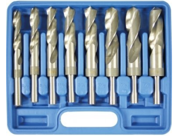
D1181 Imperial Industrial HSS Reduced Shank Drill Set