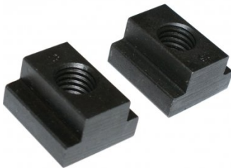
C086 Clamp Kit Tee Nuts