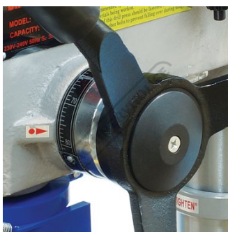
Drilling Depth Stop Setting With Scale