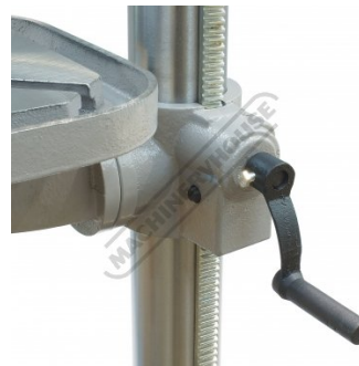
Table Height Adjustment Crank