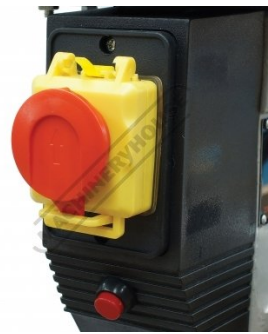
Emergency Stop Switch and Light Switch