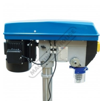
Head Side View