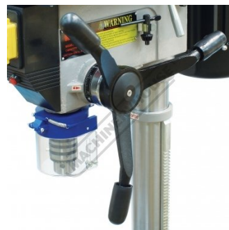
1 Piece Cast Iron Drilling Lever