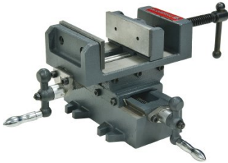
V1204 Compound Drill Vice