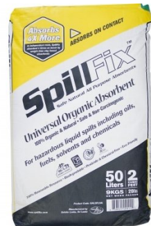
O000 SpillFix Universal Organic Absorbent