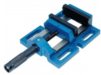
V144 Drill Press Vice