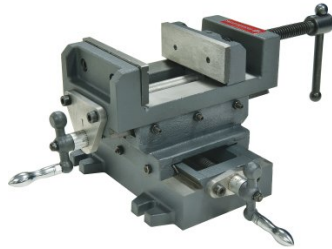
V1205 Compound Drill Vice