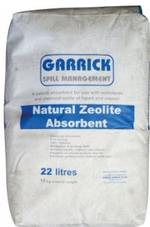
O000A Natural Zeolite Absorbent