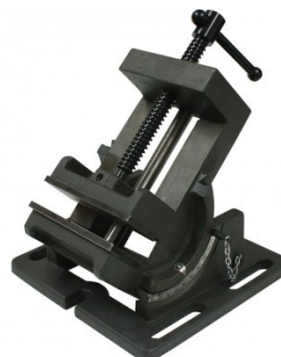
V114 Tilting Drill Press Vice