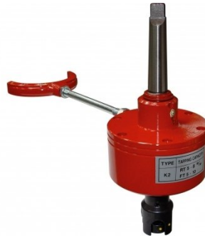
T002 Reversible Tapping Chuck