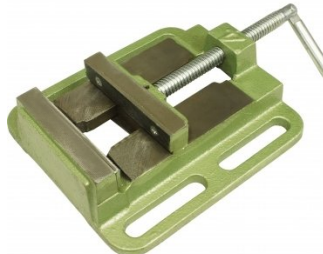
V124 Drill Press Vice