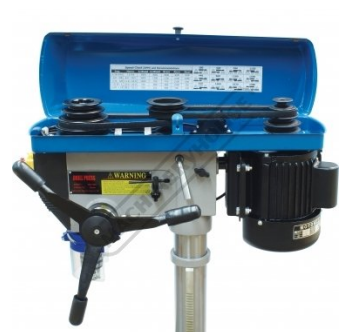
A Section Belt Drive System