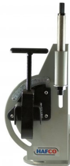
P090 Pipe & Tube Notcher Attachment