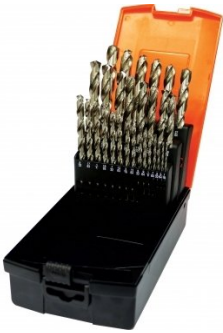
D1282 Imperial Precision HSS Drill Set - 29 Piece